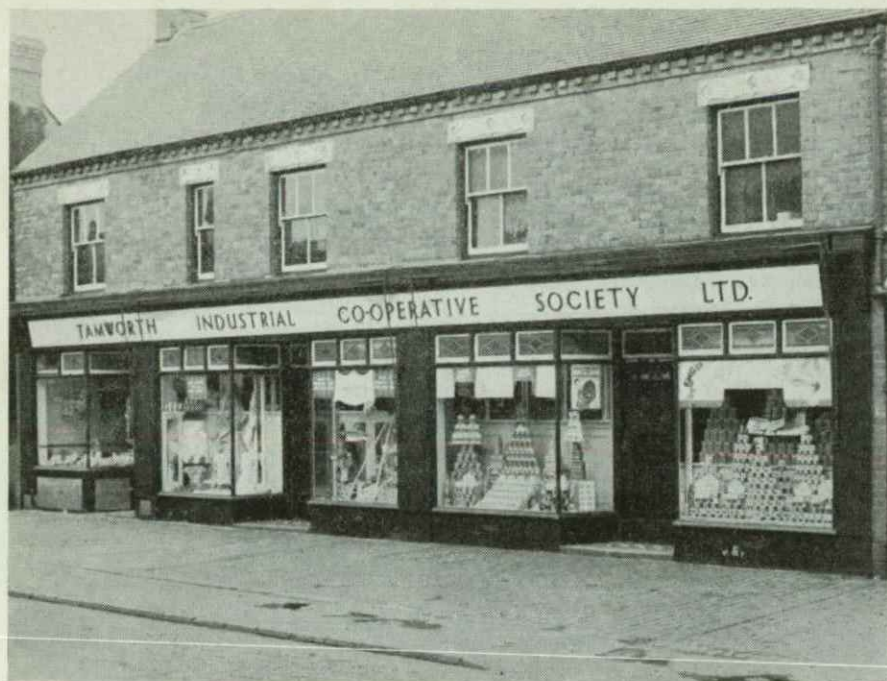
No. 1 BRANCH, NEW STREET, DORDON